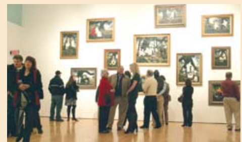
A retrospective of George Rodrigue's Legends and Lives of Acadiana is on exhibit at the Acadiana Center for the Arts. Patrons gathered for the opening.

This annual crawfish boil is "always a must do" event & one of the most enjoyable mixers in Lafayette, while offering one of the greatest vantage points of Lafayette's magnificent Downtown. Join friends for a spectacular breezy cool evening high above Lafayette's civic, cultural and economic heart. For reservations or ticket information call 291.5566 www.downtownlafayette.org