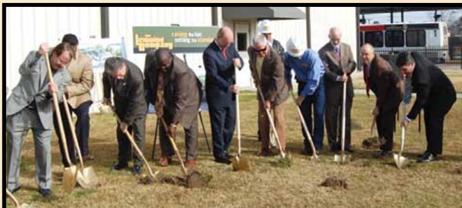
Breaking Ground: Final Phase of the Rosa Parks Multitmodal Transportation Center Downtown officials were present at the much anticipated Rosa Parks Multimodal Transportation Center Groundbreaking, held on January 19. The final phase of this $8.1 M project is slated for completion in summer 2011.