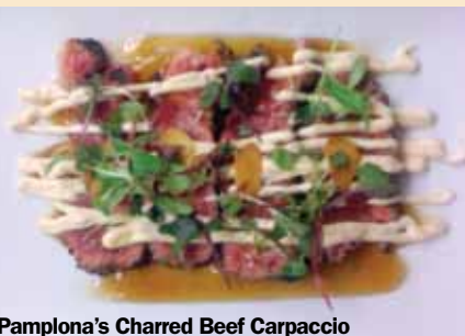
Pamplona's Charred Beef Carpaccio

Also offering outdoor dining, Johnson's Boucaniere, Artmosphere, and Keller's Bakery. Be sure to try any one of Downtown's many restaurants. View the directory on page 4 for a full listing.