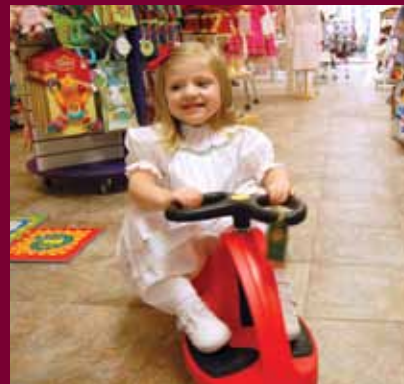
It's different downtown. The plasma car only at Teche Drugs.