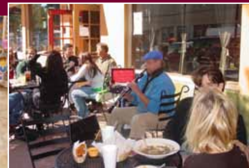
Experience the unexpected.