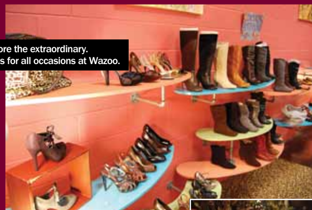
Explore the extraordinary. Boots for all occasions at Wazoo.