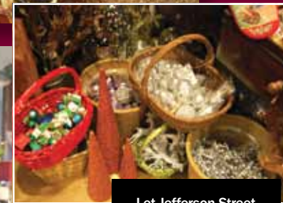
Let Jefferson Street Market deck your halls and your home.