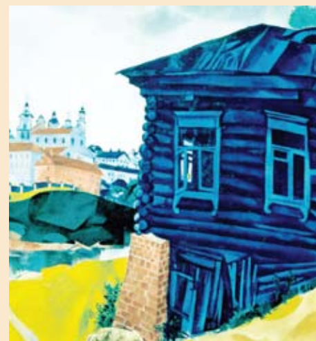
The Blue House, 1917 Oil on Canvas; 26" x 38 1/8" Musée d'Art Moderne, Liege, Belgium © 1995 ARS, New York/ADAGP, Paris

See online at www.acadianacenterforthearts.org for more detailed information and schedules of associated activities.